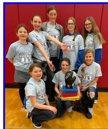
The Battle of the Books team poses with their trophy!